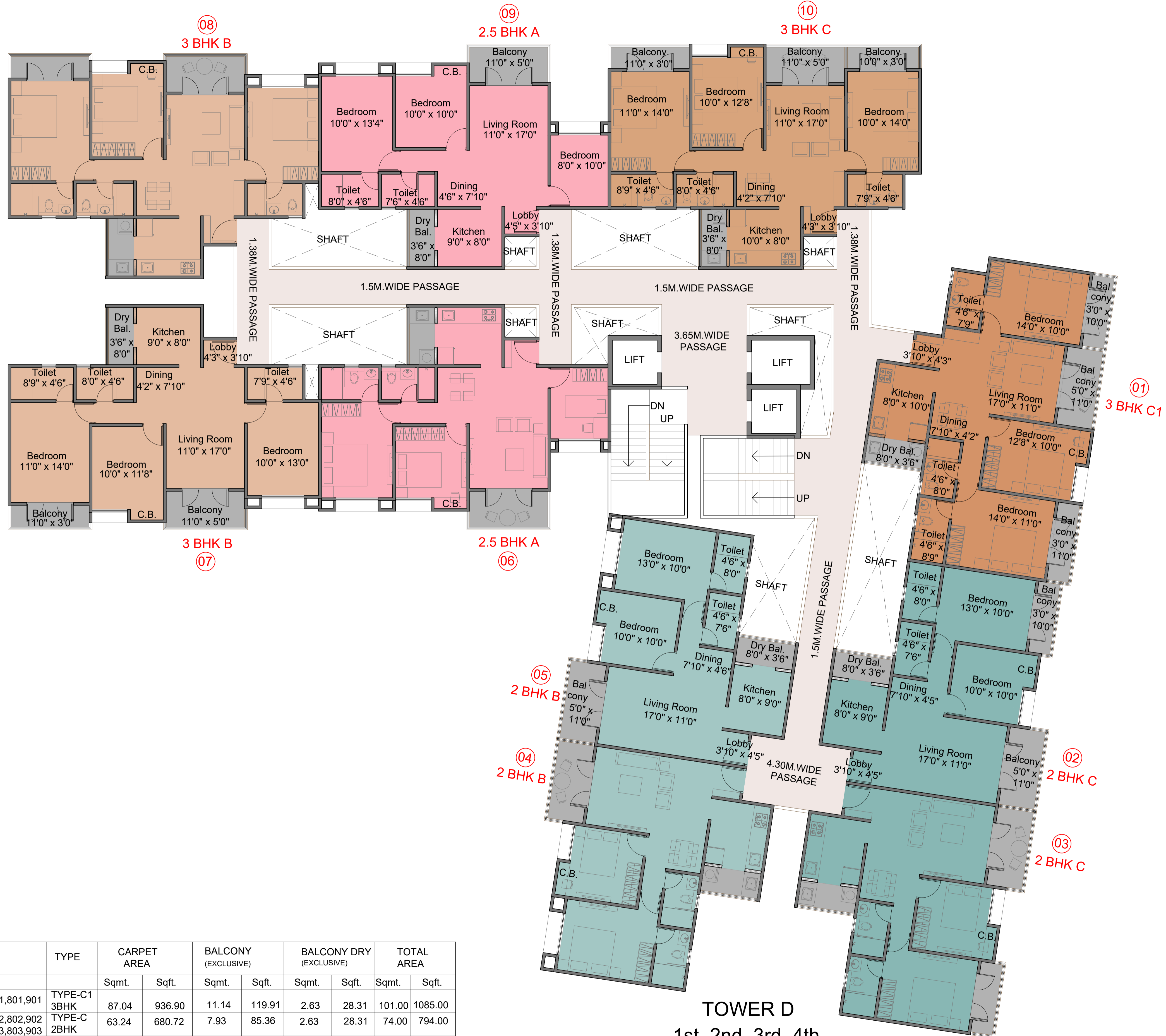
TOWER D 1st, 2nd, 3rd, 4th, 5th, 6th, 8th, 9th